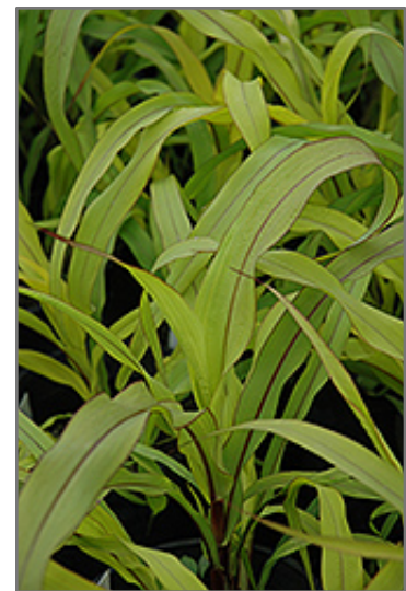
Jester Millet foliage