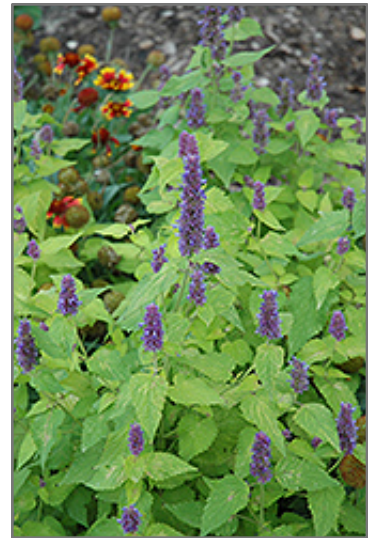
Golden Jubilee Anise Hyssop flowers

Golden Jubilee Anise Hyssop is a dense herbaceous perennial with an upright spreading habit of growth. Its medium texture blends into the garden, but can always be balanced by a couple of finer or coarser plants for an effective composition.