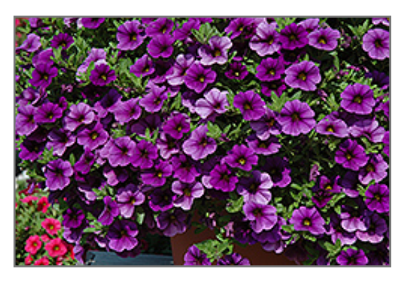
Cabaret Deep Blue Calibrachoa flowers