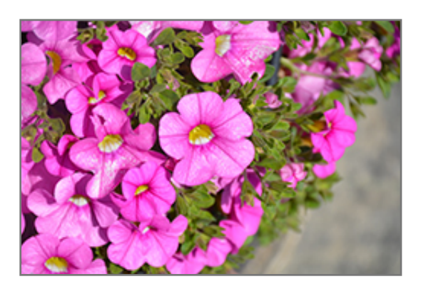
Cabaret Light Pink Calibrachoa flowers