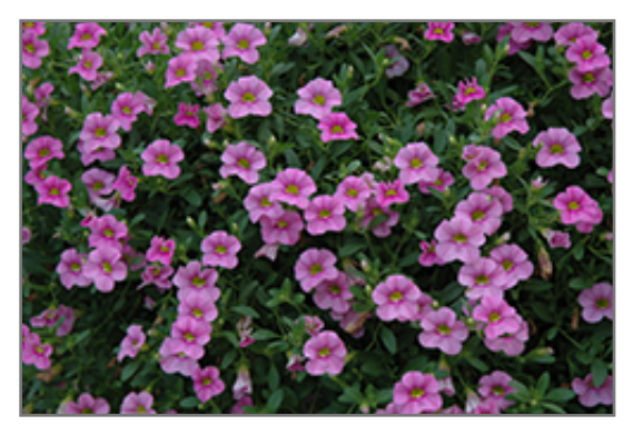
Cabaret Light Pink Calibrachoa flowers

Cabaret Light Pink Calibrachoa is recommended for the following landscape applications;