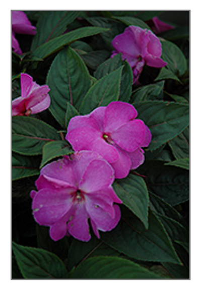
Celebration Lavender Glow New Guinea Impatiens flowers

A vigorous and well branched mounded variety with excellent shade and heat tolerance; large, vibrant blooms attract butterflies and hummingbirds; no pruning or deadheading required; excellent choice for beds, borders or large containers