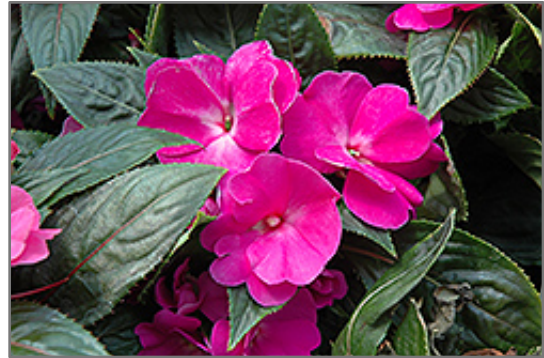
Celebration Purple New Guinea Impatiens flowers

Celebration Purple New Guinea Impatiens is recommended for the following landscape applications;