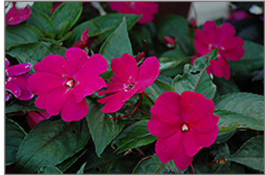
Celebration Sangria New Guinea Impatiens flowers