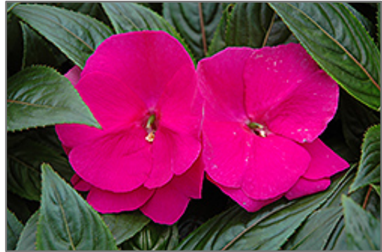
Celebrette Grape Crush New Guinea Impatiens flowers

Celebrette Grape Crush New Guinea Impatiens is recommended for the following landscape applications;