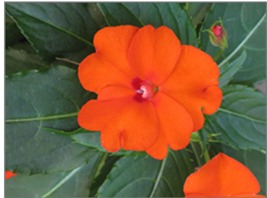
Infinity Orange New Guinea Impatiens flowers

This plant will require occasional maintenance and upkeep, and should not require much pruning, except when necessary, such as to remove dieback. It has no significant negative characteristics.