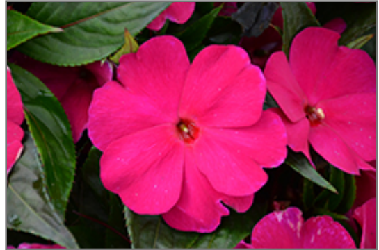
Magnum Purple New Guinea Impatiens flowers