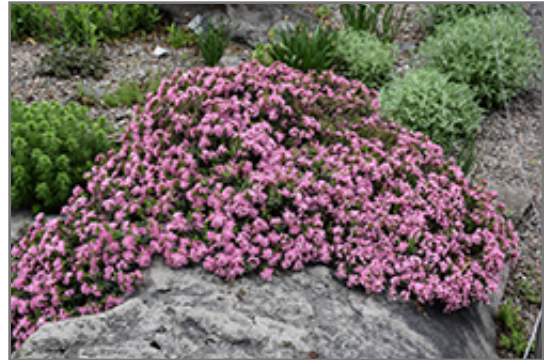
Rose Daphne in bloom