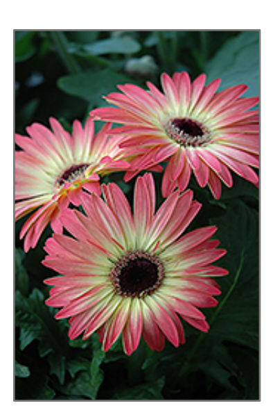
Pink and Yellow Gerbera Daisy flowers

Beautiful pink daisies with butter yellow centers and a coppery brown central disc, rise above sea green foliage on this upright variety; perfect for garden beds, borders and containers; excellent in cut-flower arrangements; adaptable as a houseplant