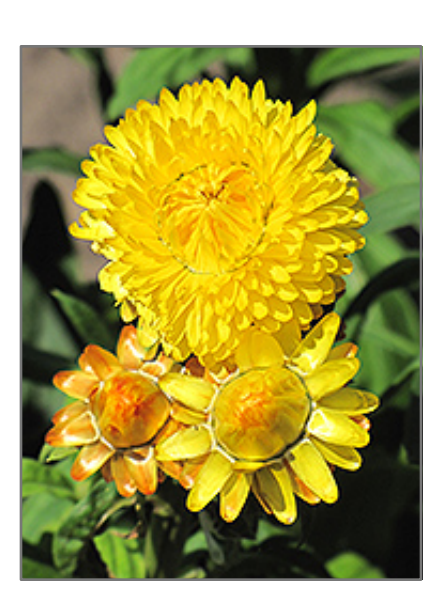
Dreamtime Jumbo Yellow Strawflower flowers