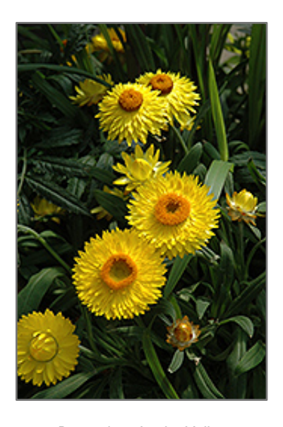
Dreamtime Jumbo Yellow Strawflower flowers