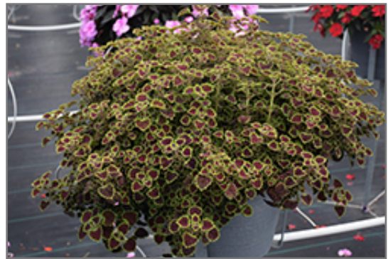
Burgundy Wedding Train Coleus