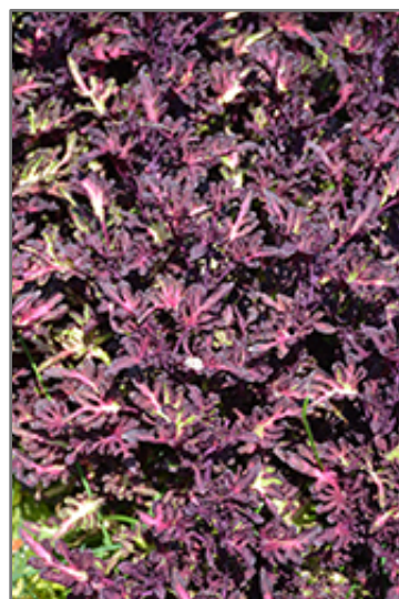
Merlin's Magic Coleus foliage