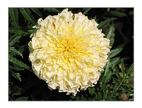
Vanilla Marigold flowers