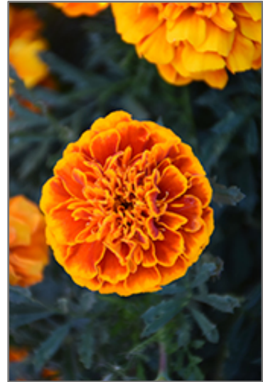
Bonanza Flame Marigold flowers