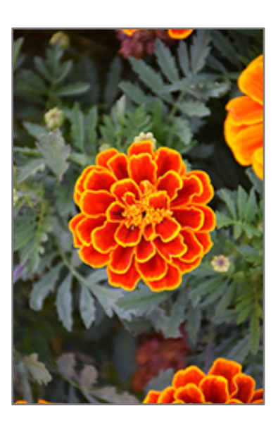
Durango Flame Marigold flowers