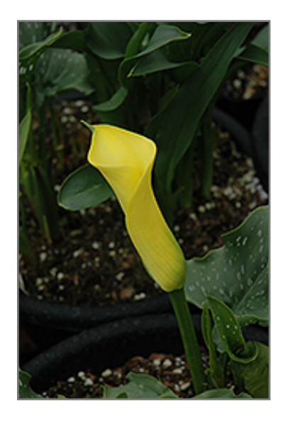
Serrada Calla Lily flowers

Serrada Calla Lily features bold yellow trumpet-shaped flowers rising above the foliage from early summer to early fall. The flowers are excellent for cutting. Its attractive large glossy heart-shaped leaves remain dark green in colour with distinctive white spots throughout the season.