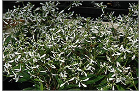
Silver Fog Euphorbia flowers