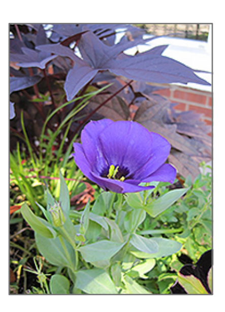
Forever Blue Lisianthus flowers