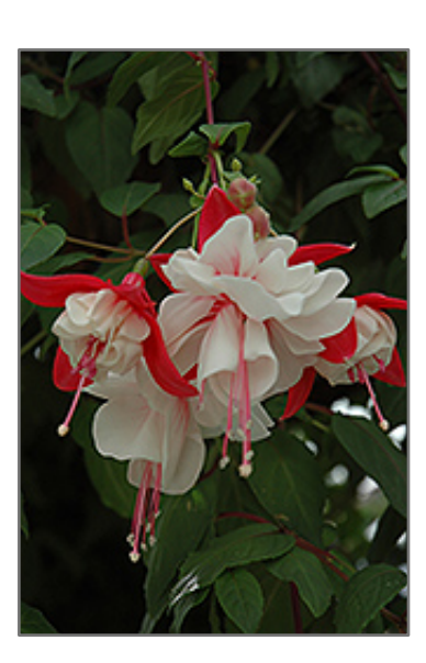
Swingtime Fuchsia flowers

Swingtime Fuchsia features dainty nodding semi-double white frilly flowers with red calyces at the ends of the branches from mid summer to early fall, which emerge from distinctive red flower buds. Its pointy leaves remain green in colour throughout the year.