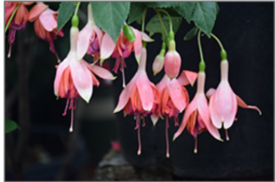
Bicentennial Fuchsia flowers