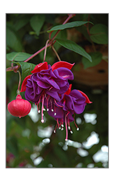
Blue Eyes Fuchsia flowers

Blue Eyes Fuchsia features dainty nodding semi-double purple frilly flowers with lilac purple overtones and pink calyces at the ends of the branches from mid summer to early fall, which emerge from distinctive pink flower buds. Its pointy leaves remain green in colour throughout the year.