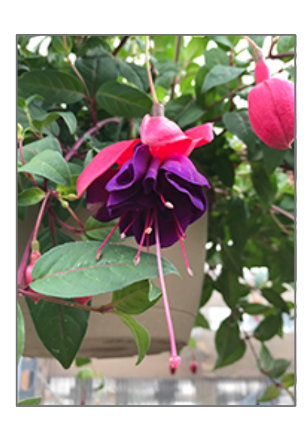
Dark Eyes Fuchsia flowers

Dark Eyes Fuchsia features dainty nodding semi-double purple frilly flowers with red bracts at the ends of the branches from mid summer to early fall, which emerge from distinctive red flower buds. Its pointy leaves remain green in colour throughout the year.