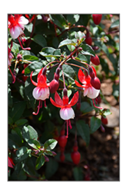
Santa Claus Fuchsia flowers

Santa Claus Fuchsia features dainty nodding semi-double white frilly flowers with red bracts at the ends of the branches from mid summer to early fall, which emerge from distinctive red flower buds. Its pointy leaves remain green in colour throughout the year.