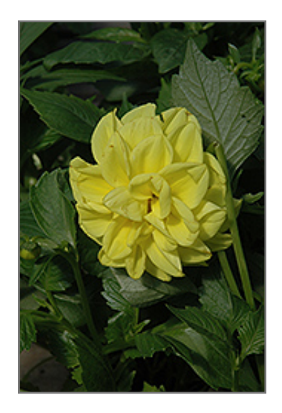
Figaro Yellow Dahlia flowers

Figaro Yellow Dahlia features showy double yellow ball-shaped flowers at the ends of the stems from mid to late summer. The flowers are excellent for cutting. Its pointy leaves remain green in colour throughout the season.