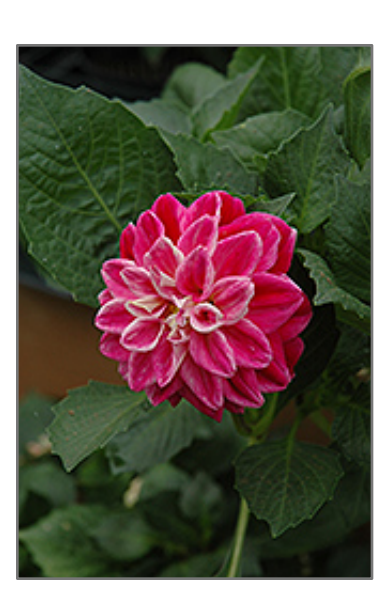
Louise Dahlia flowers

Louise Dahlia features showy double hot pink daisy flowers with white edges at the ends of the stems from mid to late summer. The flowers are excellent for cutting. Its pointy leaves remain green in colour throughout the season.