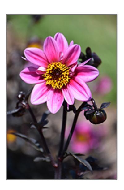
Mystic Dreamer Dahlia flowers