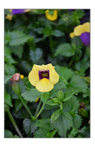
Catalina Gilded Grape Torenia flowers

Catalina Gilded Grape Torenia is recommended for the following landscape applications;