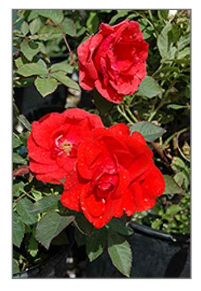
Morden Fireglow Rose flowers