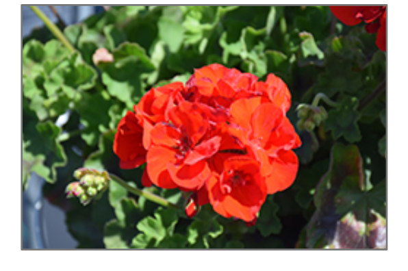
Americana Bright Red Geranium flowers