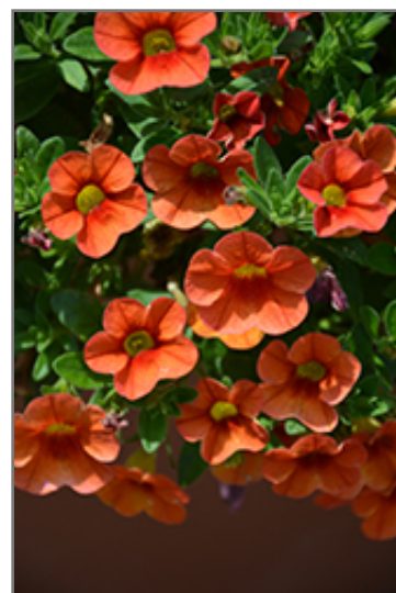
Aloha Hot Orange Calibrachoa flowers