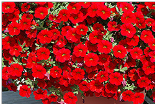
Cabaret Bright Red Calibrachoa flowers

Cabaret Bright Red Calibrachoa is recommended for the following landscape applications;