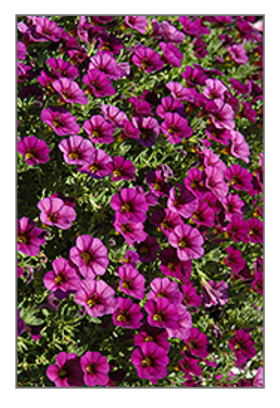
Cabaret Purple Gem Calibrachoa flowers

A beautiful trailing variety that produces boldly colored blooms that blanket green foliage; perfect for patio containers, hanging baskets and garden landscapes; heat tolerant and self cleaning-no deadheading needed; attracts pollinators