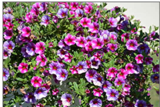
Can-Can Hot Pink Star Calibrachoa flowers