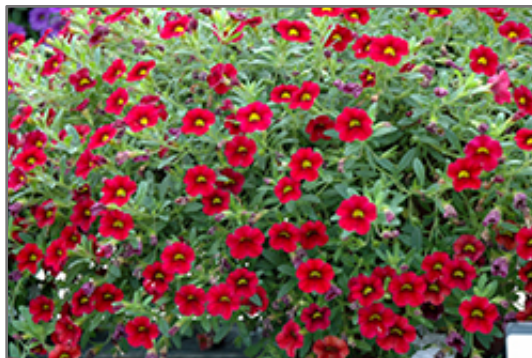
MiniFamous Compact Dark Red Calibrachoa flowers

MiniFamous Compact Dark Red Calibrachoa is recommended for the following landscape applications;