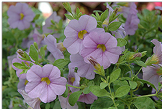
Superbells Miss Lilac Calibrachoa flowers

Superbells Miss Lilac Calibrachoa is recommended for the following landscape applications;