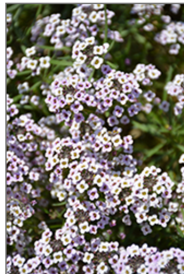
Blushing Princess Sweet Alyssum flowers

Blushing Princess Sweet Alyssum is recommended for the following landscape applications;