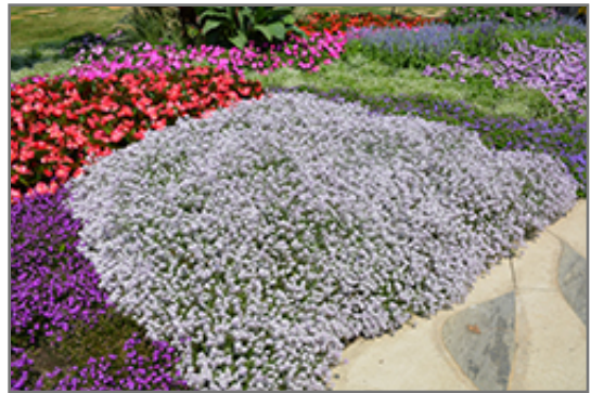
Blushing Princess Sweet Alyssum in bloom

Blushing Princess Sweet Alyssum will grow to be only 6 inches tall at maturity, with a spread of 24 inches. When grown in masses or used as a bedding plant, individual plants should be spaced approximately 20 inches apart. Its foliage tends to remain low and dense right to the ground. This fast-growing annual will normally live for one full growing season, needing replacement the following year.