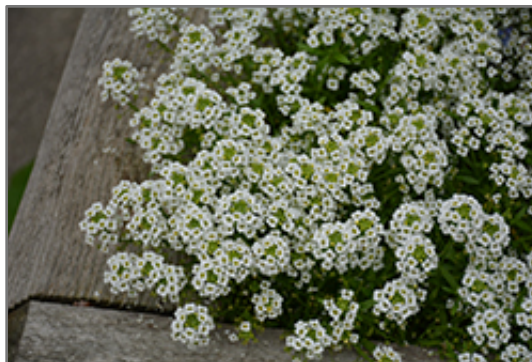
Snow Princess Alyssum flowers

Snow Princess Alyssum is recommended for the following landscape applications;