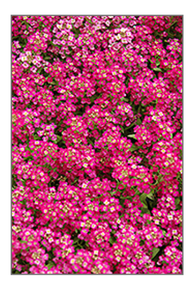
Wonderland Deep Rose Alyssum flowers

Wonderland Deep Rose Alyssum is smothered in stunning clusters of fragrant rose star-shaped flowers at the ends of the stems from mid spring to mid fall. Its tiny narrow leaves remain grayish green in colour throughout the season.