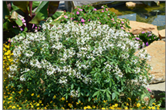
Senorita Blanca Spiderflower in bloom