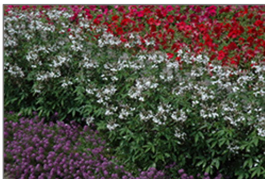
Senorita Blanca Spiderflower in bloom