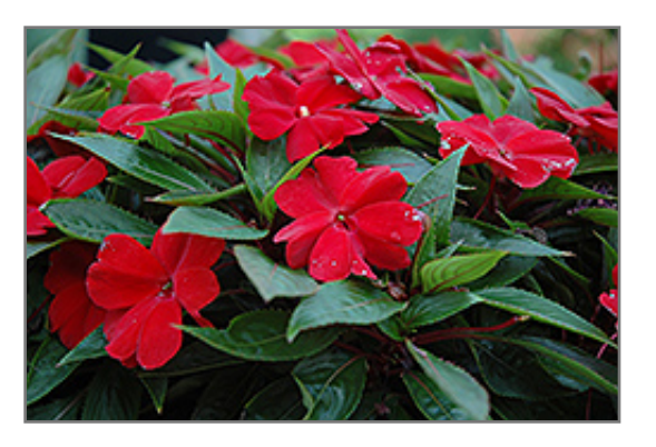
Celebrette Red New Guinea Impatiens flowers