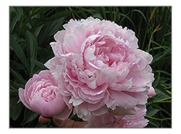
Double Pink Peony flowers