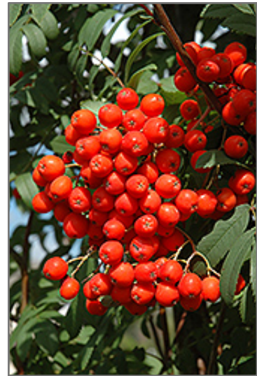
Pyramidal Mountain Ash fruit