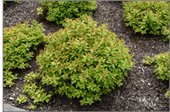
Dakota Goldcharm Spirea

This shrub should only be grown in full sunlight. It prefers to grow in average to moist conditions, and shouldn't be allowed to dry out. It is not particular as to soil type or pH. It is highly tolerant of urban pollution and will even thrive in inner city environments. This is a selected variety of a species not originally from North America.