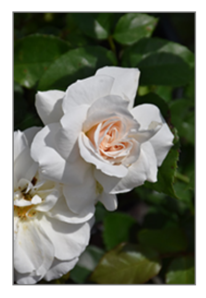
Champagne Wishes Rose flowers