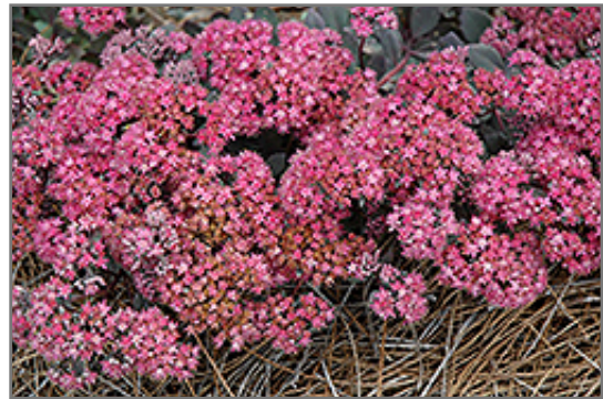
Dazzleberry Stonecrop flowers

Dazzleberry Stonecrop is a dense herbaceous perennial with an upright spreading habit of growth. Its medium texture blends into the garden, but can always be balanced by a couple of finer or coarser plants for an effective composition.