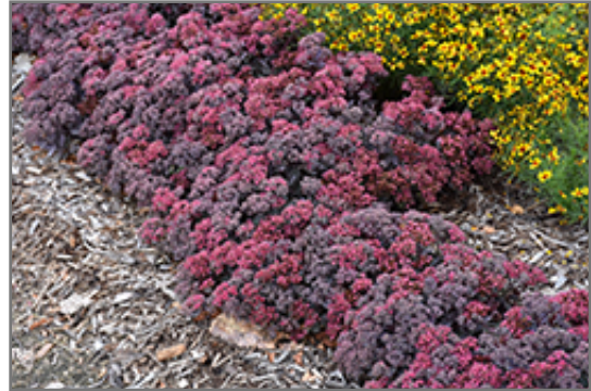
Dazzleberry Stonecrop in bloom