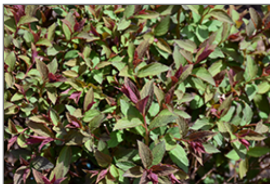
Double Play Artisan Spirea foliage