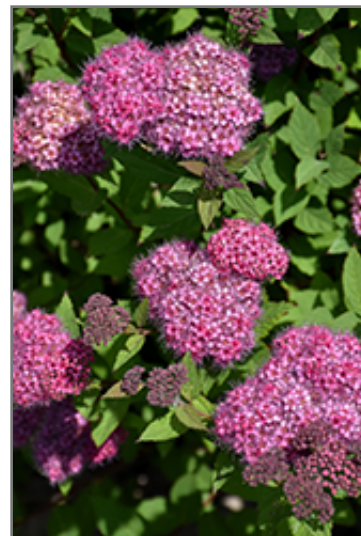
Double Play Artisan Spirea flowers

Double Play Artisan Spirea is recommended for the following landscape applications;