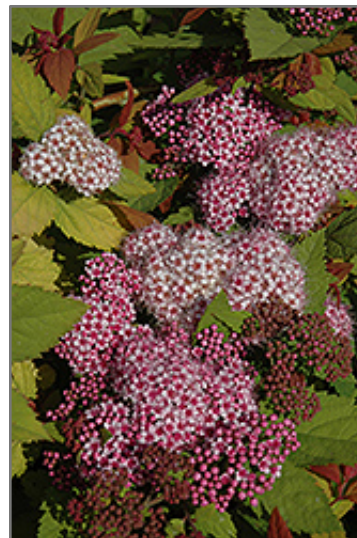
Double Play Big Bang Spirea flowers

This shrub will require occasional maintenance and upkeep, and is best pruned in late winter once the threat of extreme cold has passed. It is a good choice for attracting butterflies to your yard, but is not particularly attractive to deer who tend to leave it alone in favor of tastier treats. It has no significant negative characteristics.