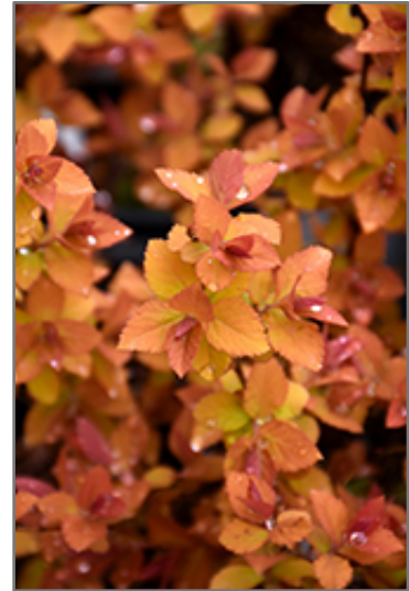
Double Play Big Bang Spirea foliage

This shrub should only be grown in full sunlight. It prefers to grow in average to moist conditions, and shouldn't be allowed to dry out. It is not particular as to soil type or pH. It is highly tolerant of urban pollution and will even thrive in inner city environments. This particular variety is an interspecific hybrid.